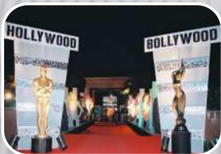
Bollywood Hollywood Theme