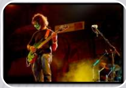
Live Band Performances