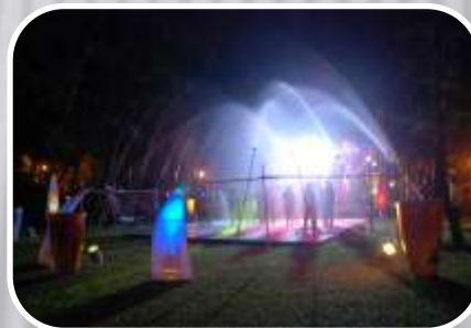
Rain Dance Party Theme