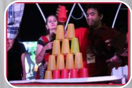
Minute to Win It