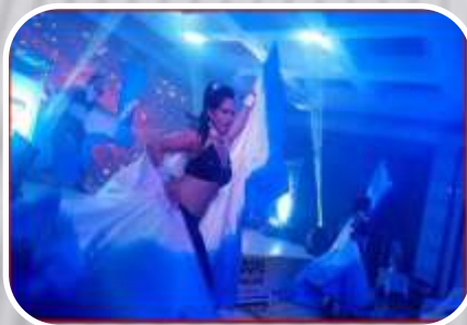
Specialized Dance Artists