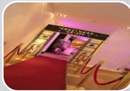
Red Carpet Theme