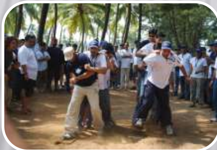
The Australian Plank walk