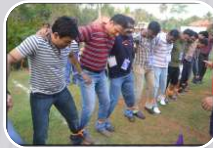
Lets Take a Walk