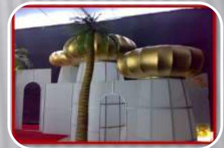
Arabian Nights Theme