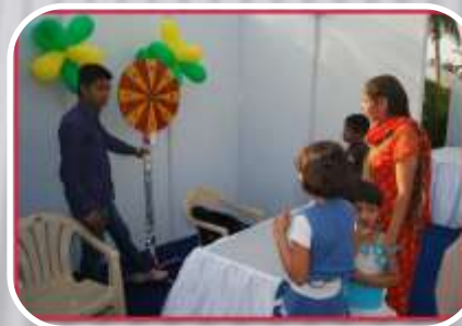
Various Game Stalls