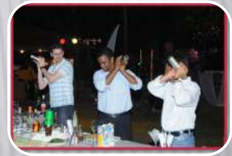
Art of Mocktails