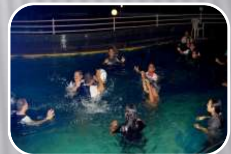
Pool Side Theme