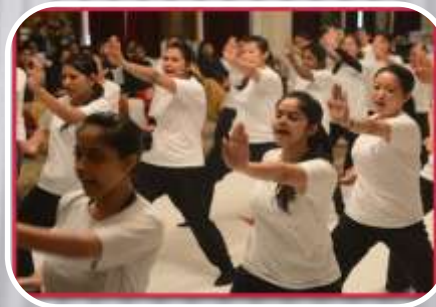
Women Defence Lessons