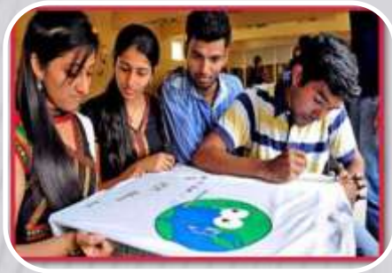
T Shirt Painting