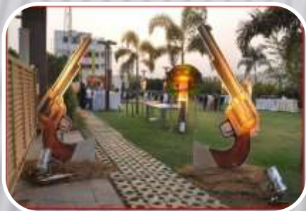
Wild Wild Texas Theme