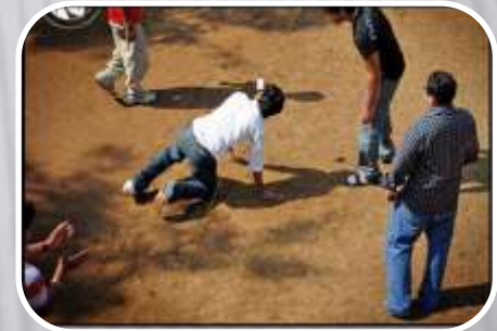
Huff N Puff